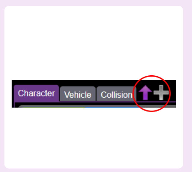
Add a new Tab to your code or move code blocks between tabs