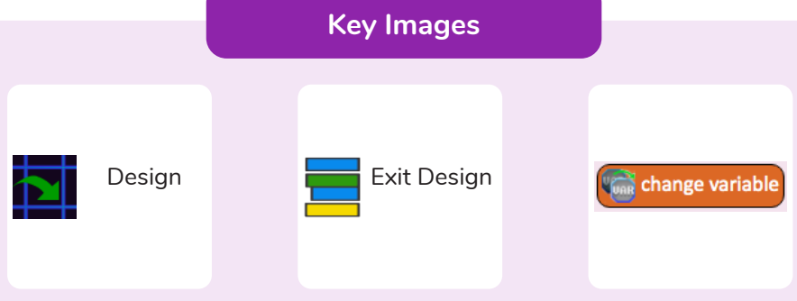
Open design mode in 2Code.